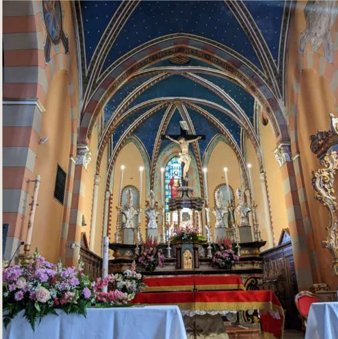
CHURCH OF SAN VITTORE