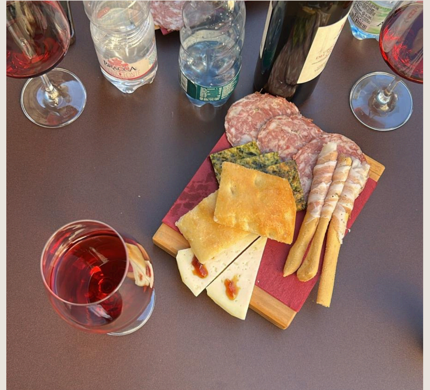
UNDERLINING THE IMPORTANCE OF BUYING AND EATING SEASONAL AND LOCAL FRUITS AND VEGETABLES