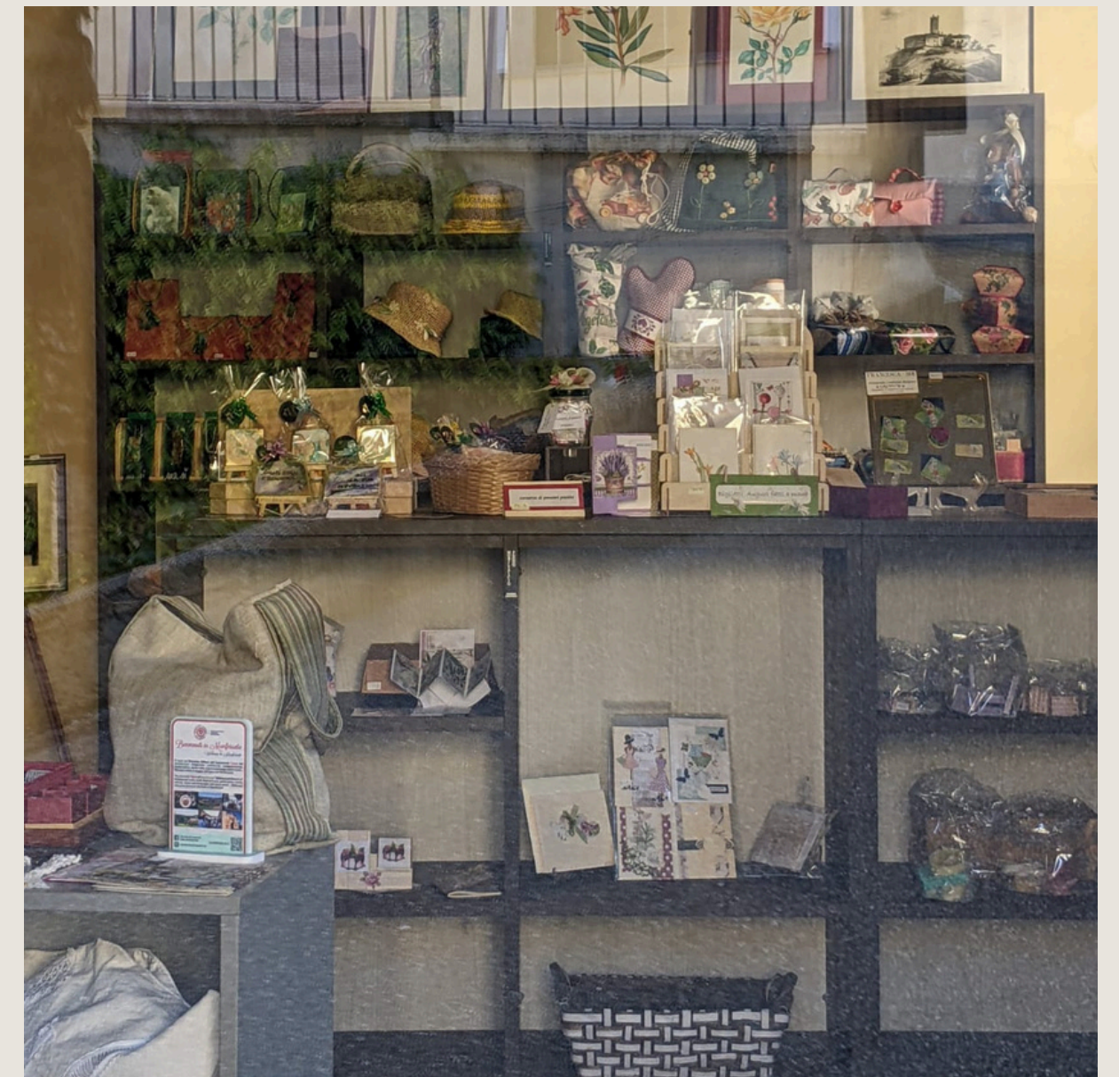
VETRINA ARTIGIANATO ROSIGNANESE